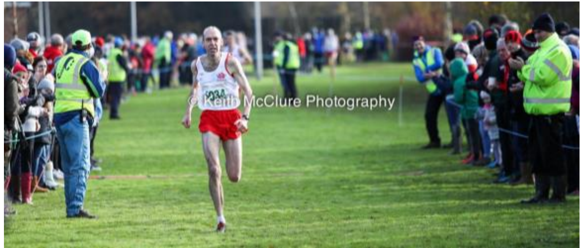
There is some good video on the TAC Vets facebook group