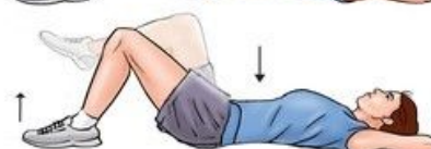
Supine hip flexion