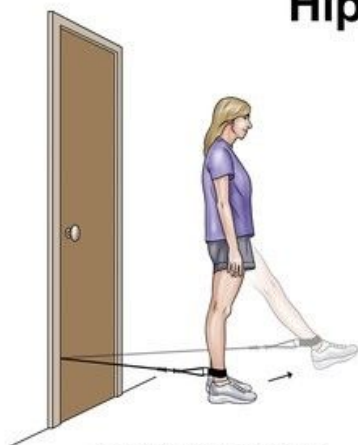
Resisted hip flexion