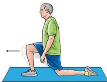
Hip flexor stretch