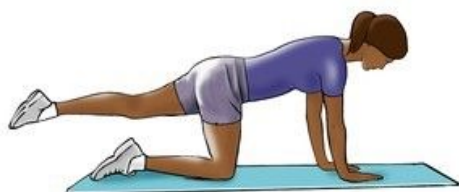
Quadruped hip extension