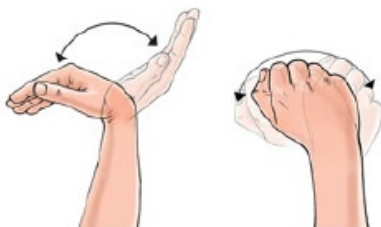
Wrist range of motion