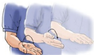
Forearm pronation and supination