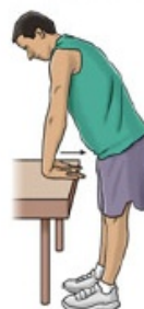
Wrist flexion stretch