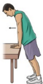
Wrist extension stretch