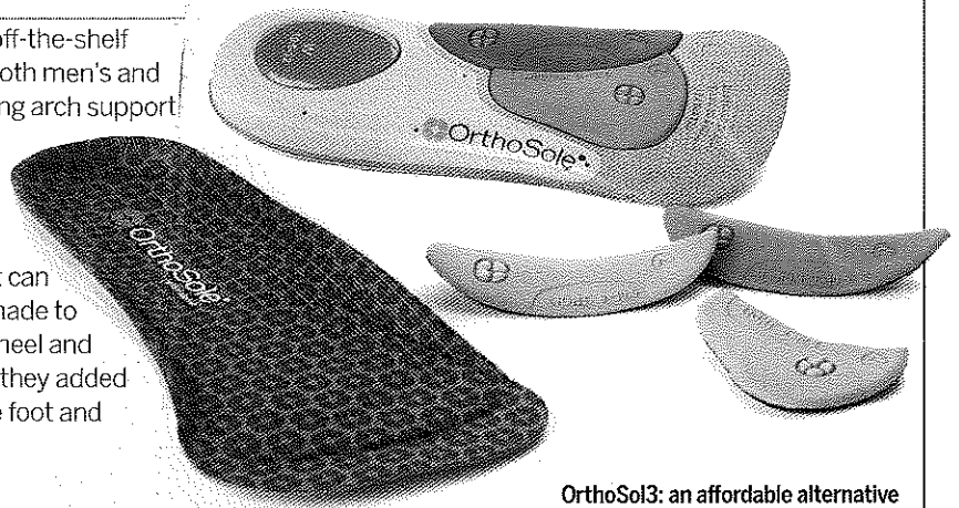
OrthoSole3: an affordable alternative for athletes considering orthotics